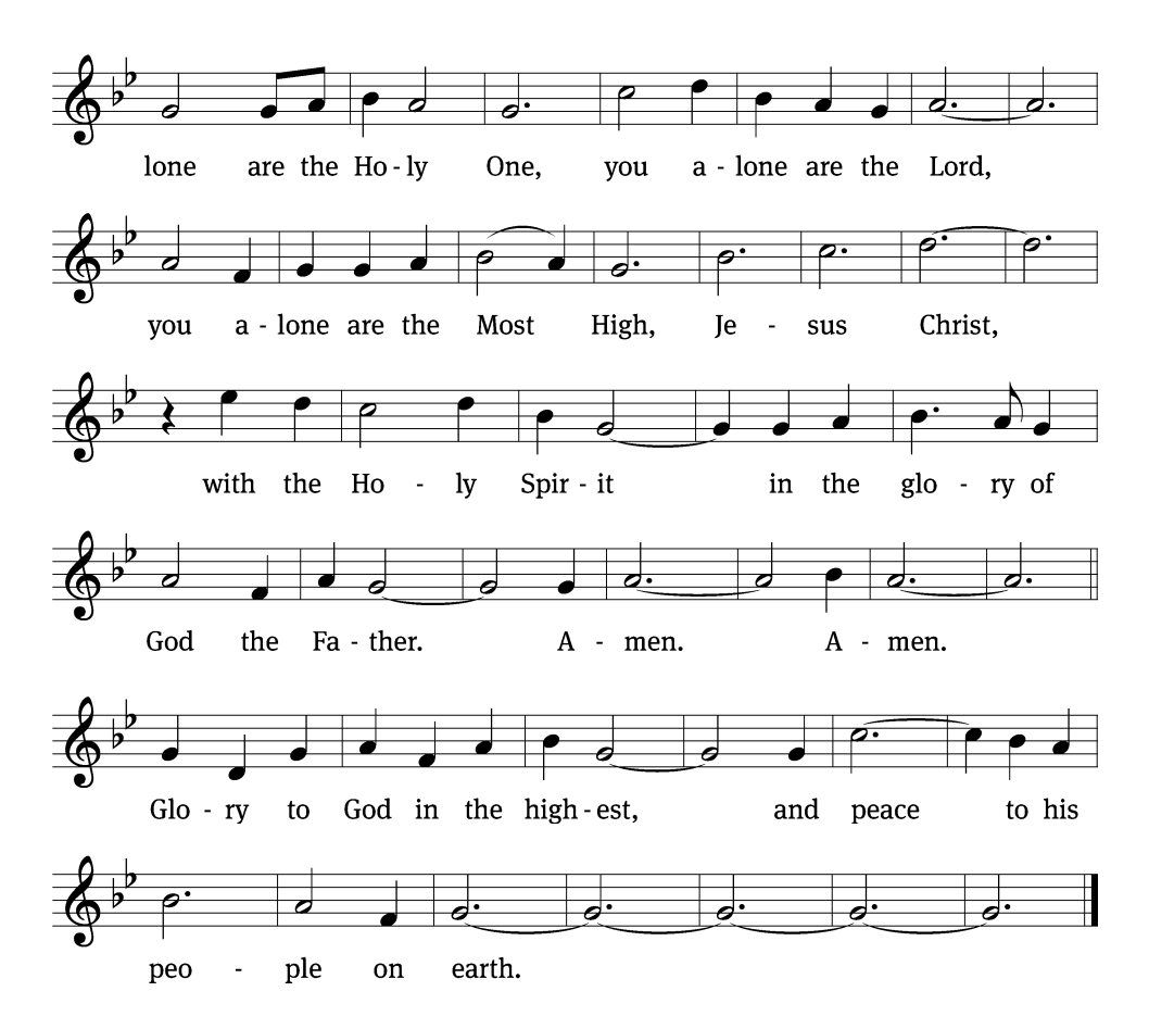
Tune: © 1984 GIA Publications, Inc. Used by permission: OneLicense no. 702194